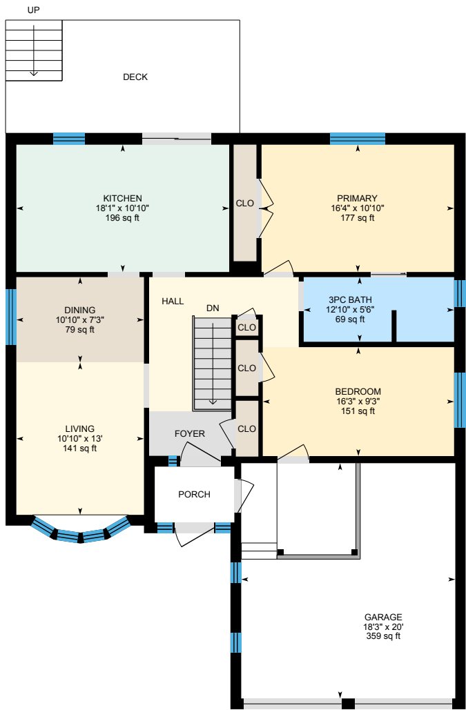
Main Floor Exterior Area 1165.41 sq ft

Main Building: Total Exterior Area Above Grade 1165.41 sq ft