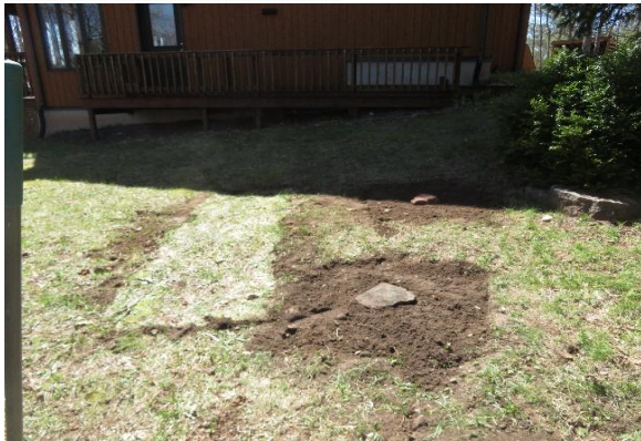
General tank location