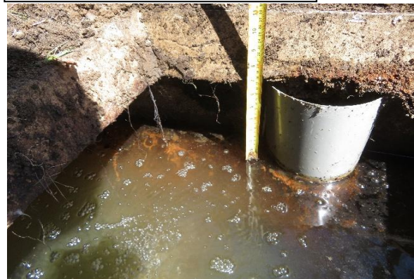
No effluent filter at outlet