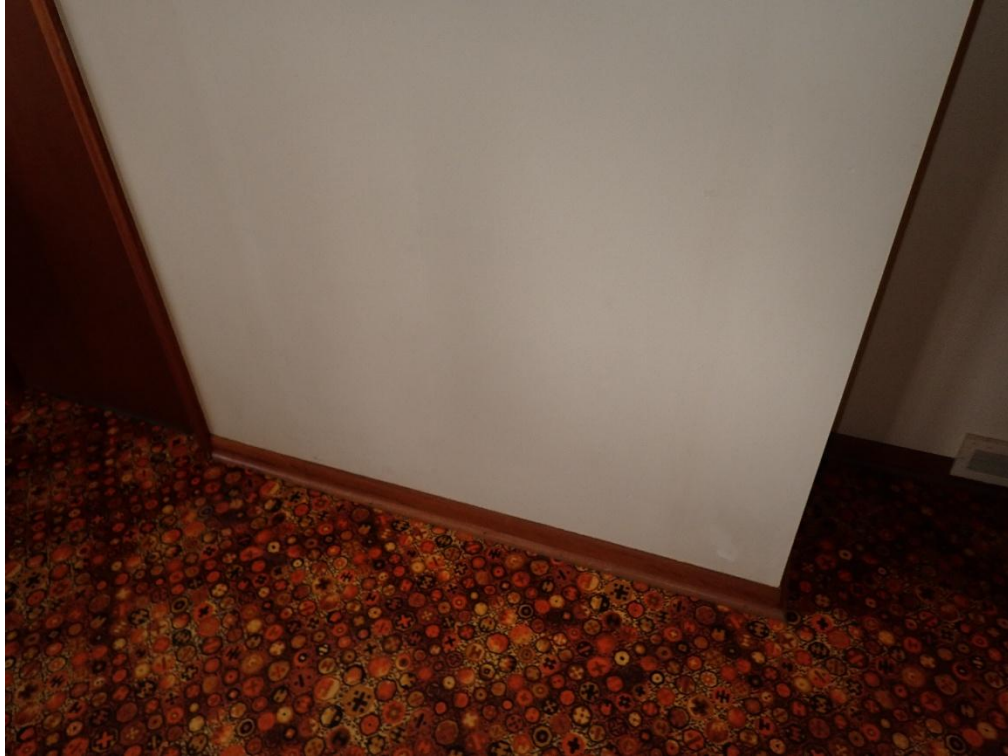
130 Confederation St – Potential Inadequate Combustible Clearance Behind this Basement Wall Behind Fireplace