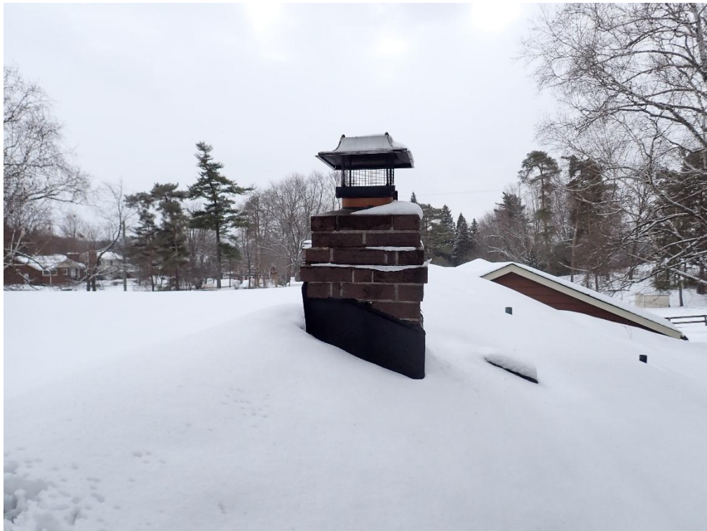
130 Confederation St – Chimney Inadequate Height Above Roof Line