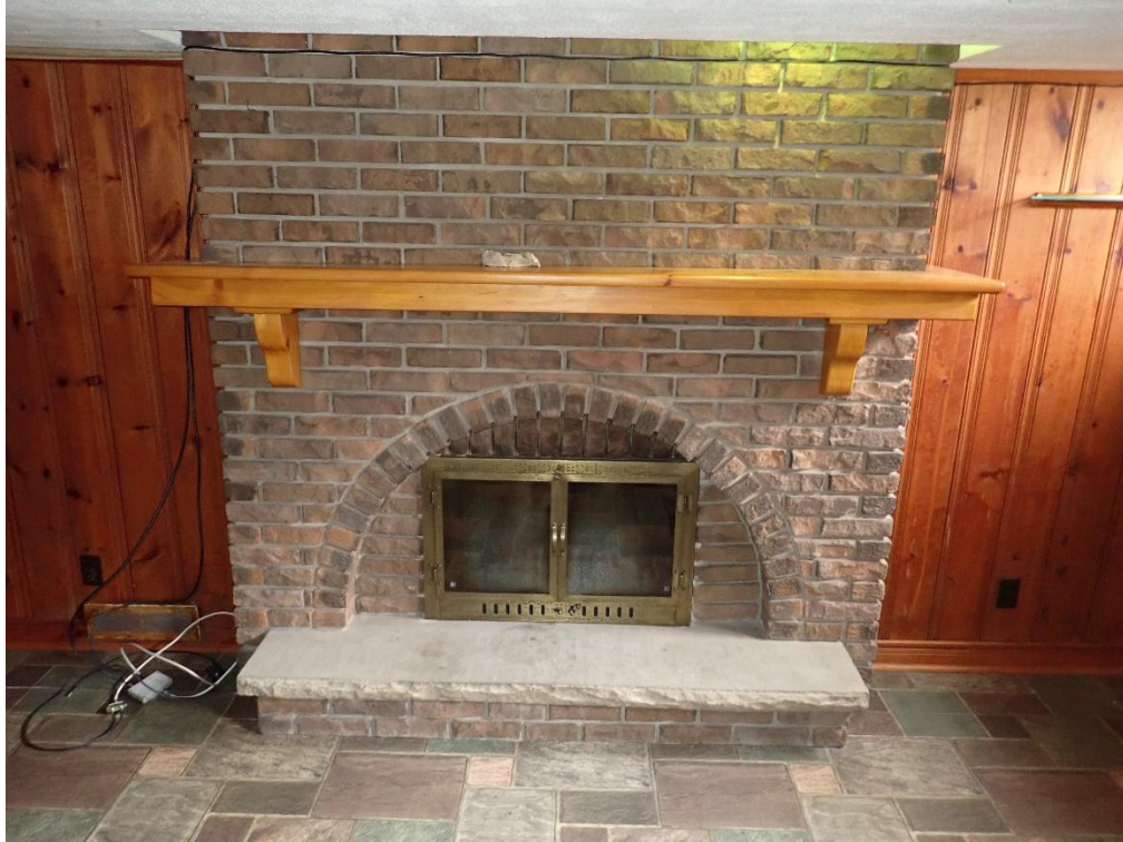
130 Confederation St – Basement Fireplace Overview