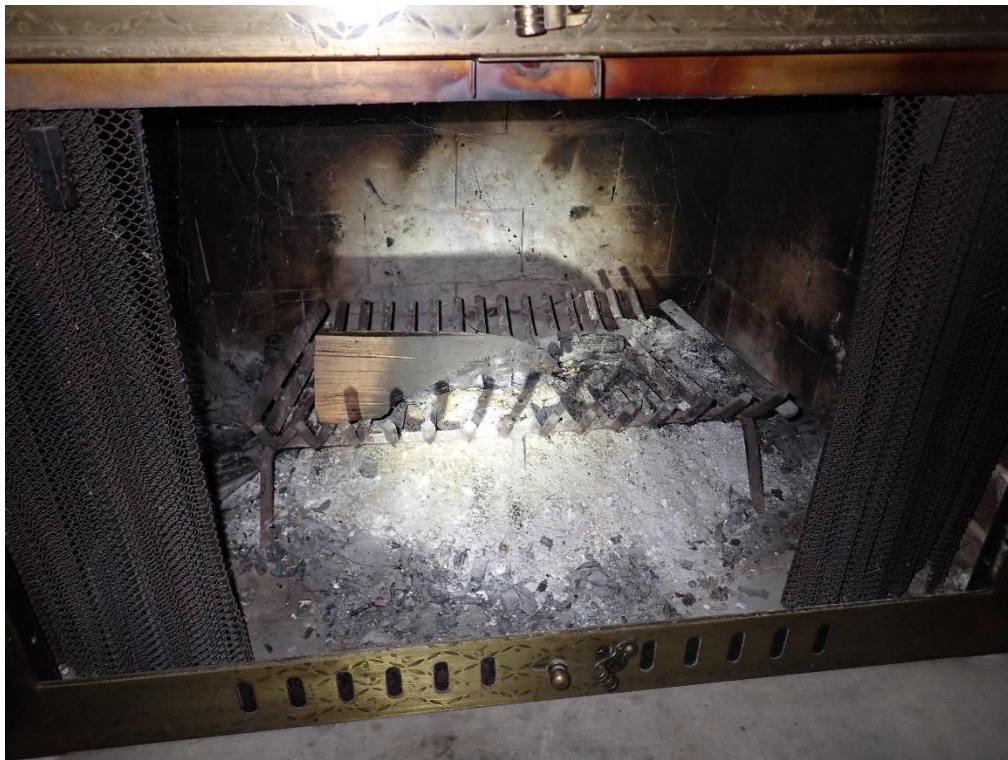
130 Confederation St – Basement Masonry Firebox